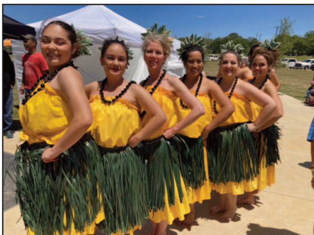
Members from a halau get ready to perform on the stage.

Granbury, Benbrook, White Settlement, Arlington, the Naval Air Station Joint Reserve Base and many other areas.