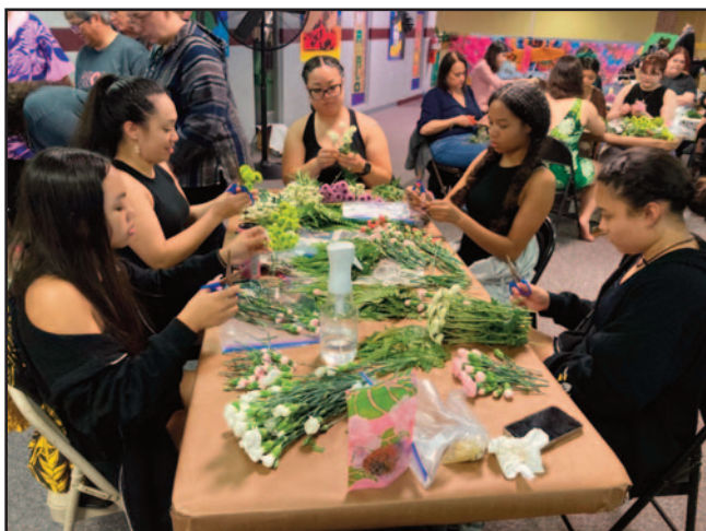
Individuals at the lei workshop prep flowers to create their lei.