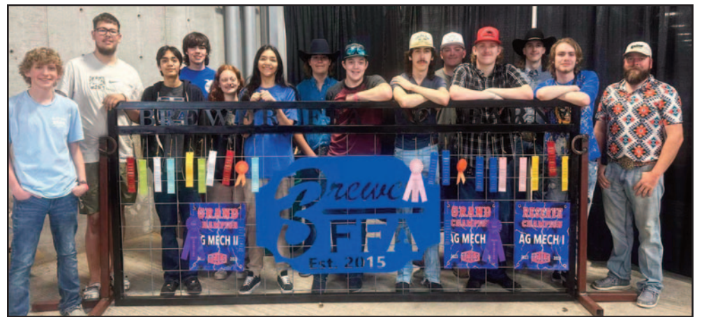
Tarrant County Jr. Livestock Show and Youth Fair Ag Mechanics Show Winners

Brewer High School FFA members with large projects competed in one of the most difficult shows of the season, the Houston Ag Mechanics Major, and BHS students took top awards.