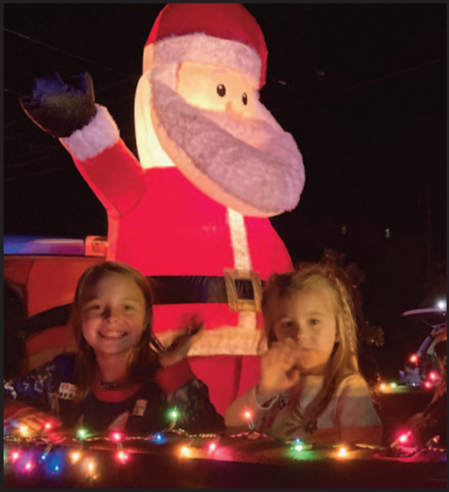
These two parade entrants wave to the audience.