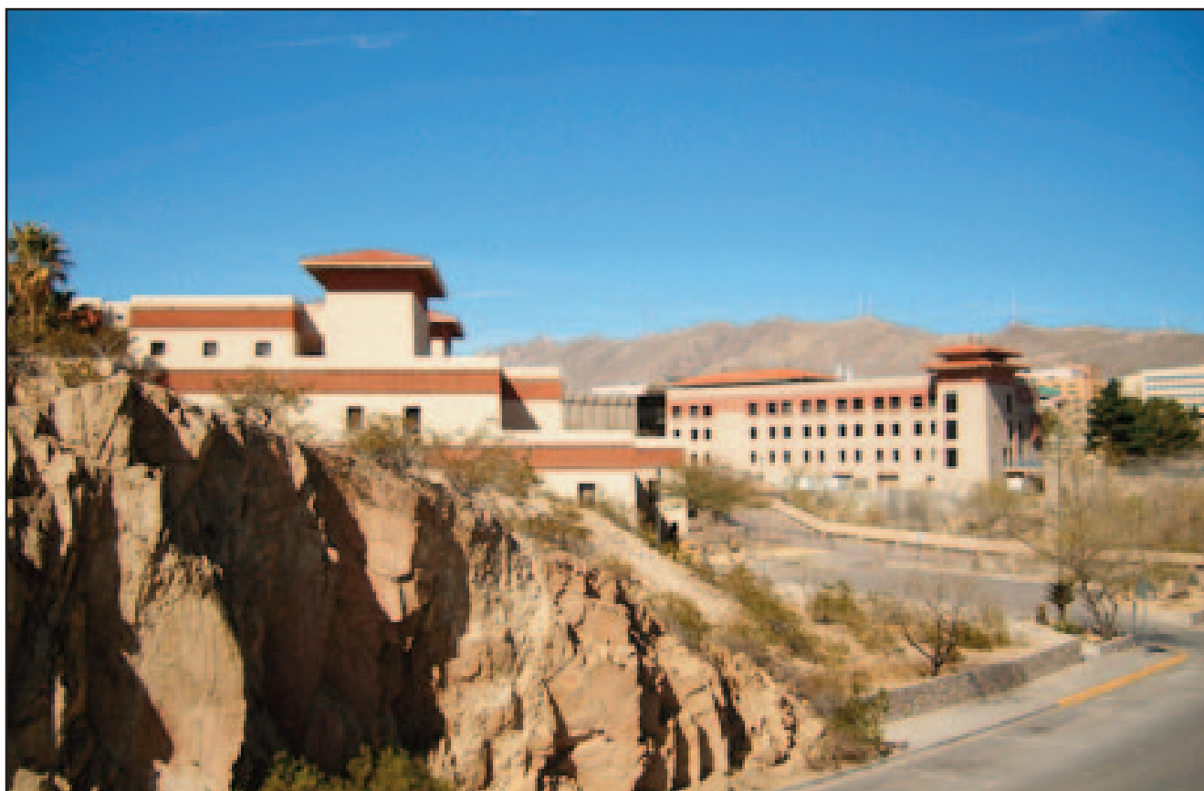
Buildings modeled after Bhutanese monasteries, or dzongs. To the left is the College of Business Administration, to the right the College of Engineering

The pursuit of knowledge can sometimes take us in unusual directions.