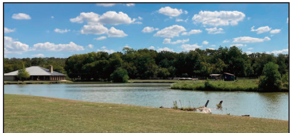
Beautiful Camp Carter pond.