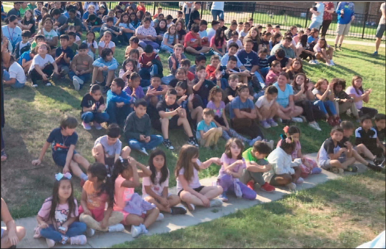
Students gathered to witness the ground breaking ceremony.