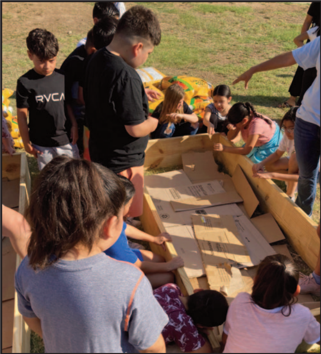
Parents and students worked together to assemble the vegetable garden beds.