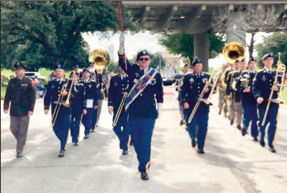
A beautiful display of "Colors"