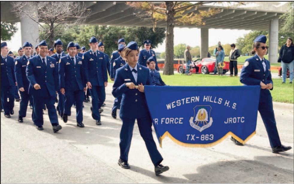
Western Hills High School Air Force JROTC