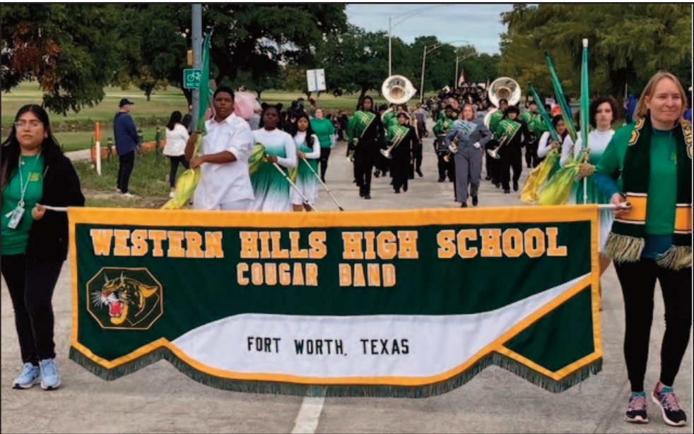
Western Hills High School Marching Band

as an armistice procession through downtown in 1919 to honor those who fought in WWI. The event was a huge success and was enjoyed by everyone in attendance.