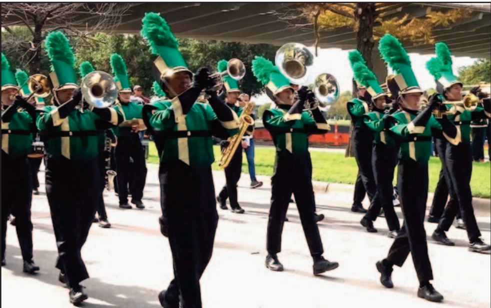
The Benbrook High School Marching Band.