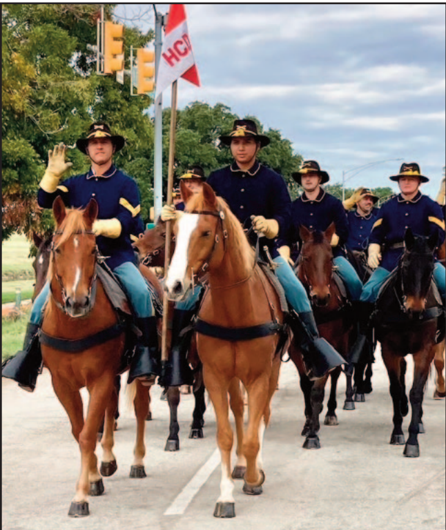
The 1st Calvary Mounted Division Horse Detachment from Fort Cavazos.