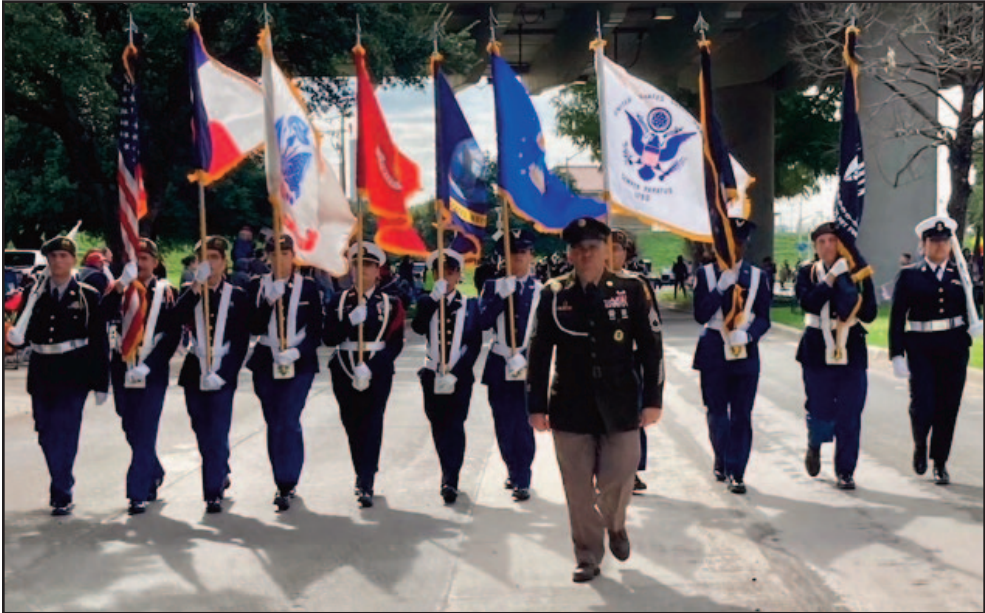
A beautiful display of "Colors"