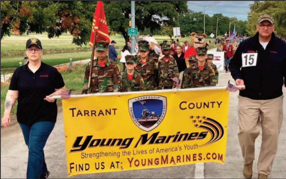
The Tarrant County Young Marines