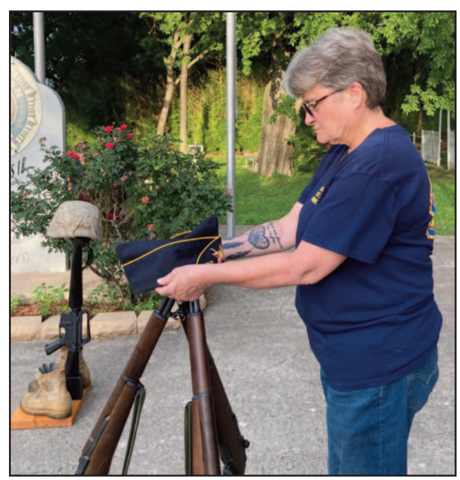
ican Legion cap on the rifles.

The deceased are remembered and we thank them for their contribution of service to our Country, community and the Post.