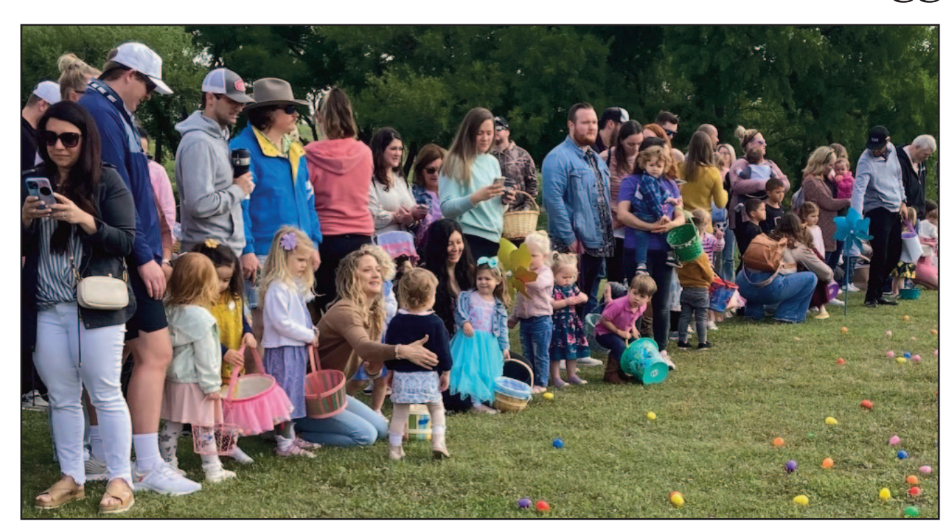
The weather was perfect for Easter Egg Hunts all over the community.